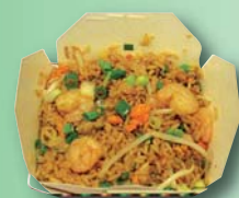
Shrimp Fried Rice