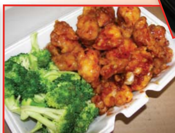
General Tso's Delight