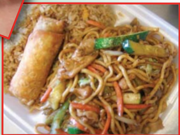
Chicken Lo Mein Combo