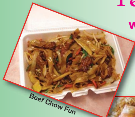
Beef Chow Fun