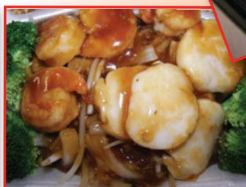
Shrimp & Scallops