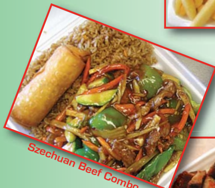
Szechuan Beef Combo