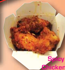
Spicy Fried Chicken Wings