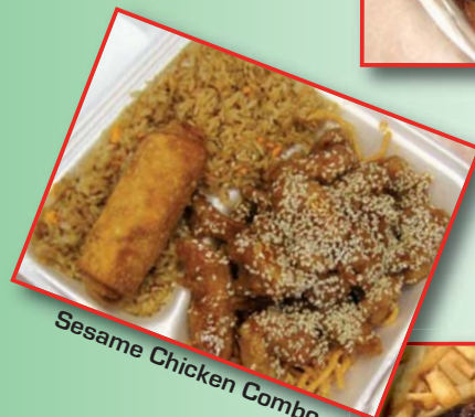
Sesame Chicken Combo