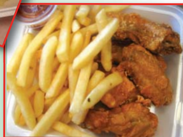
Wings & Fries